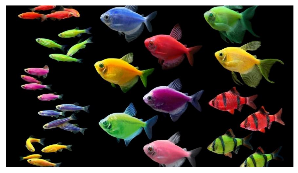
Figure 3. There is a total of four species of transgenic fluorescent GloFish® available in six colors.

early environmental and ethical concerns about GloFish (Rao, 2005), these concerns have waned over time. GloFish is subject to enforcement discretion in the US. This is not a determination of "safety" under the Federal Food, Drug, and Cosmetic Act but is instead a determination that, based on risk, FDA does not believe it would be a good use of its limited resources to act against sponsors for the marketing and distribution of these unapproved products. Its sale is prohibited in other jurisdictions, including Europe, Australia, and Singapore. The success of this product suggests that consumers are willing to purchase GE animals, at least as aquarium pets. Alan Blake, CEO of the company marketing GloFish, wrote regarding public acceptance that consumers will purchase a product that they desire, irrespective of the breeding method that was used to produce it. In his words, "It is not about the process [of genetic engineering], it is about the product" (Blake, 2016).